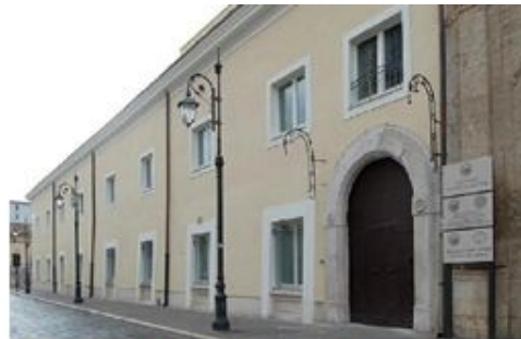
Department of Literature and Education