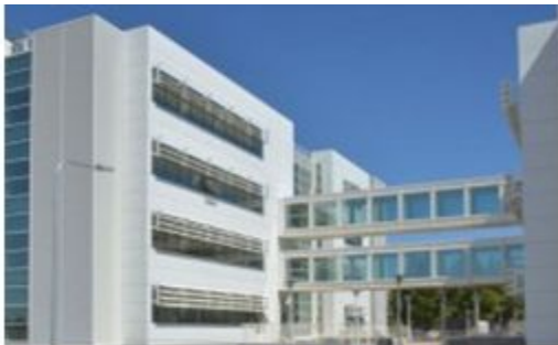
Department of Medicine