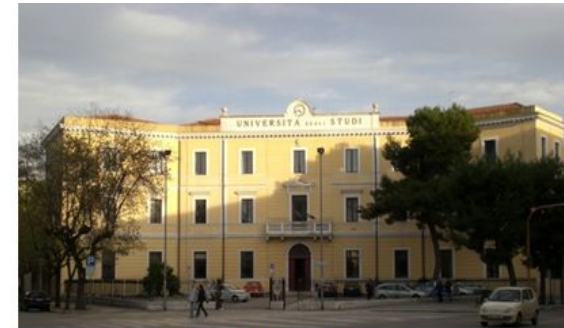
Department of Law