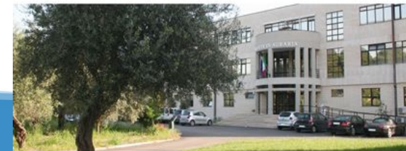
Department of Agriculture and food science