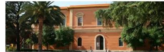
Department of Economics